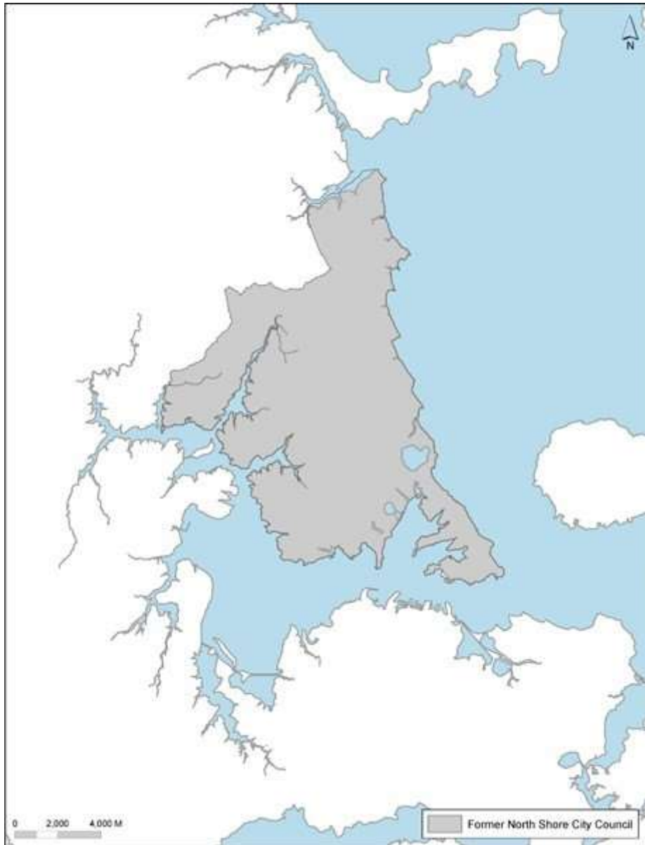
Map 2: Coastal protection yard - Area 2