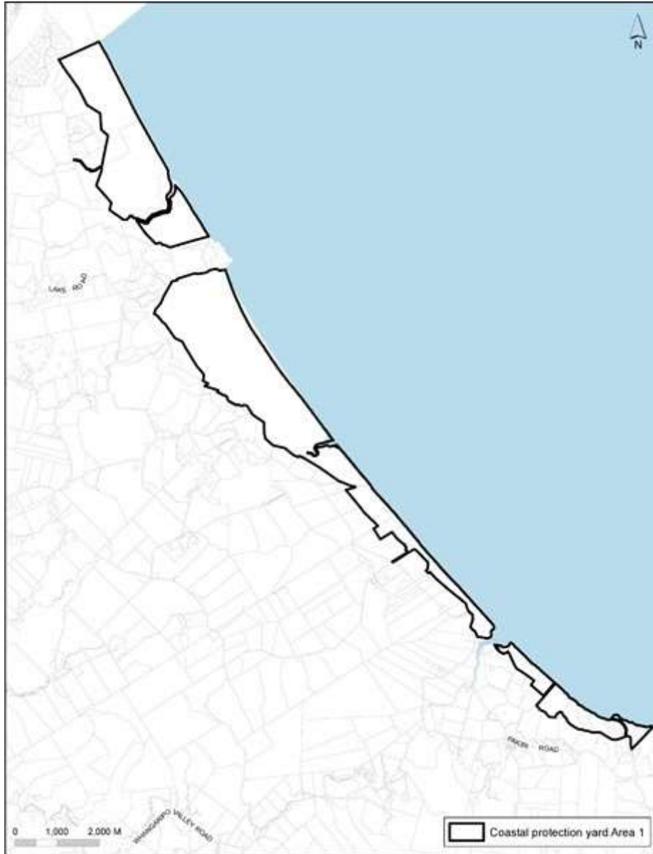
Map 1: Coastal protection yard - Area 1

For the area identified in Map 1 as Area 1 a 200m Coastal Protection Yard will apply.