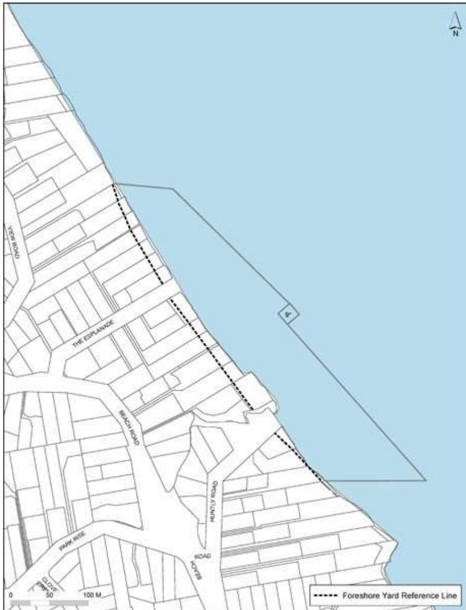
Map 3A: Campell's Bay